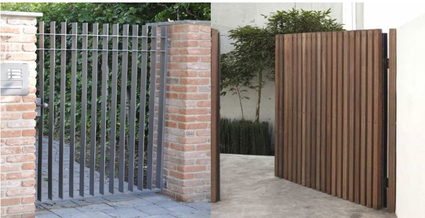
Brick wall with contemporary metal railing and timber gate