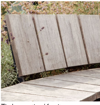
Timber seating / furniture