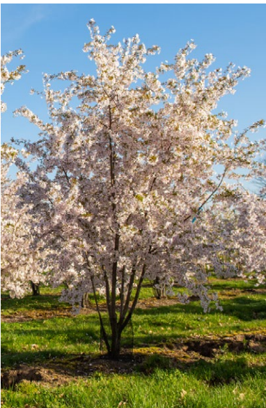
Prunus x yedoensis (through the seasons)