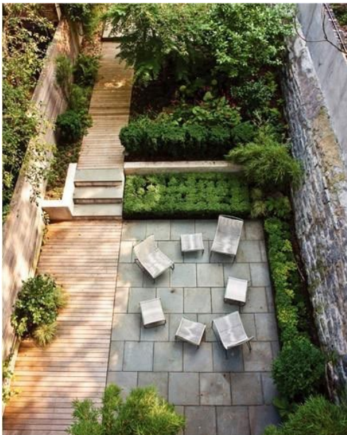
Variety of surfaces creates garden rooms