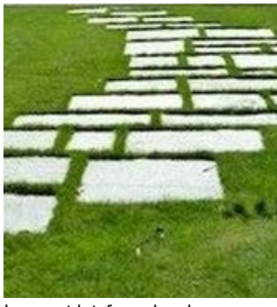
Lawn with informal path