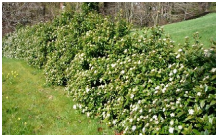
Informal evergreen hedging