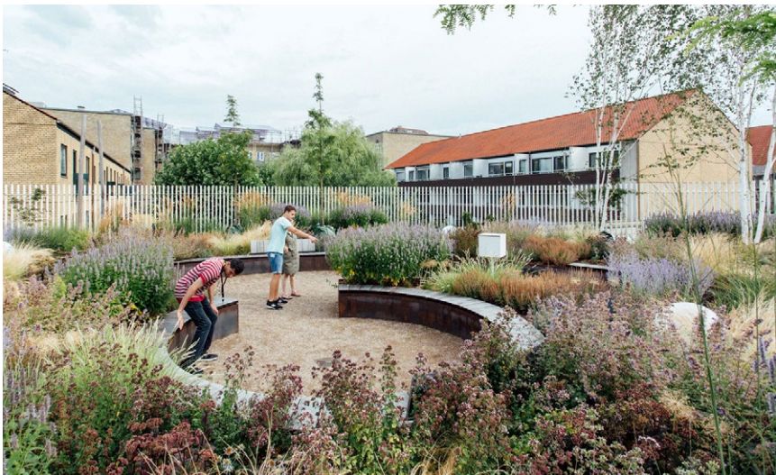
Colourful planting and seating