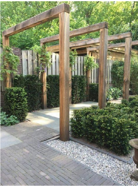
Timber frames provide rhythm and act as a landmark between garden rooms