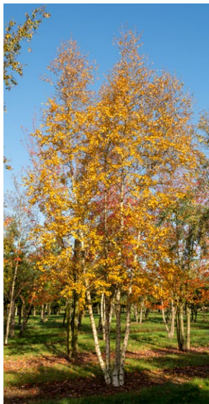
Betula pendula (through the seasons)