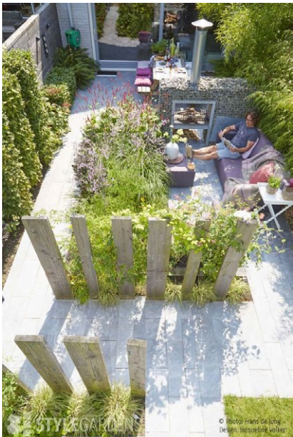
Using planting / features to indicate a change of direction