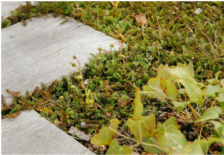
Scented plants create a nice smell when crushed