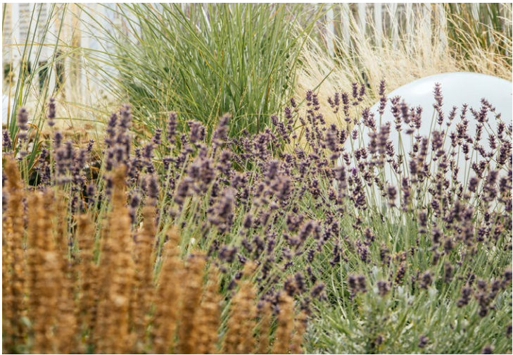
Colourful textured plants