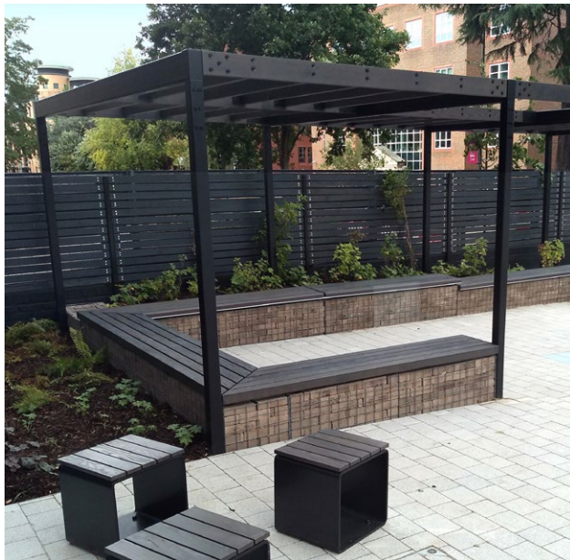
Light weight pergola with seating and climbing plants