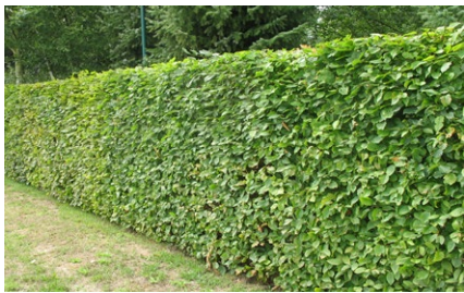
Native Hornbeam hedging