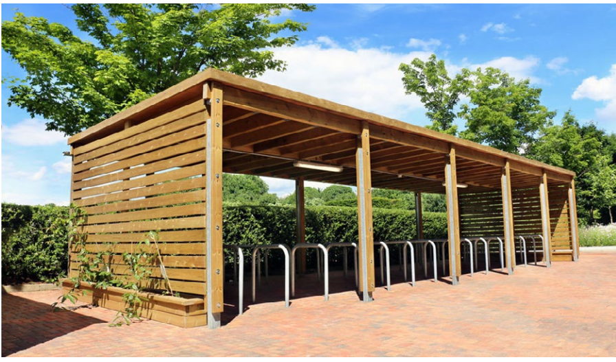
Covered cycle parking