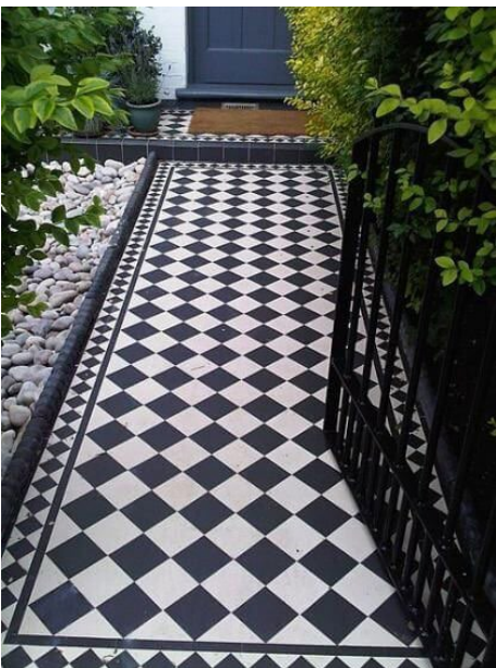
Mosaic tiles at garden entrance