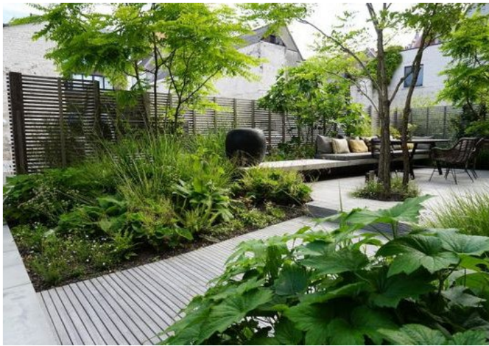
Use of planting to frame garden rooms