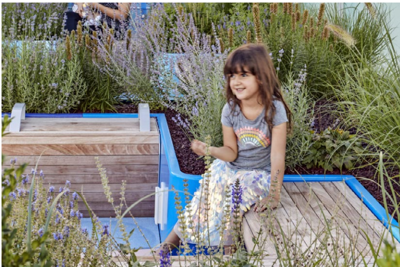
Raised growing beds with colourful seating