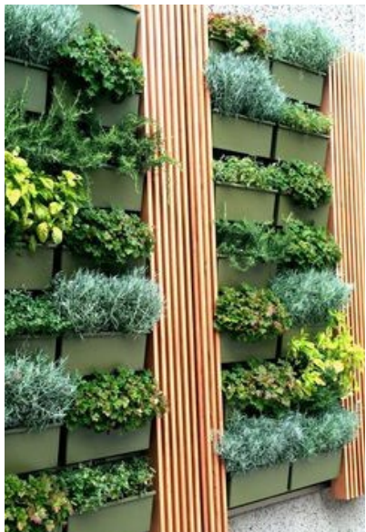
Edible Green (Herb) Wall